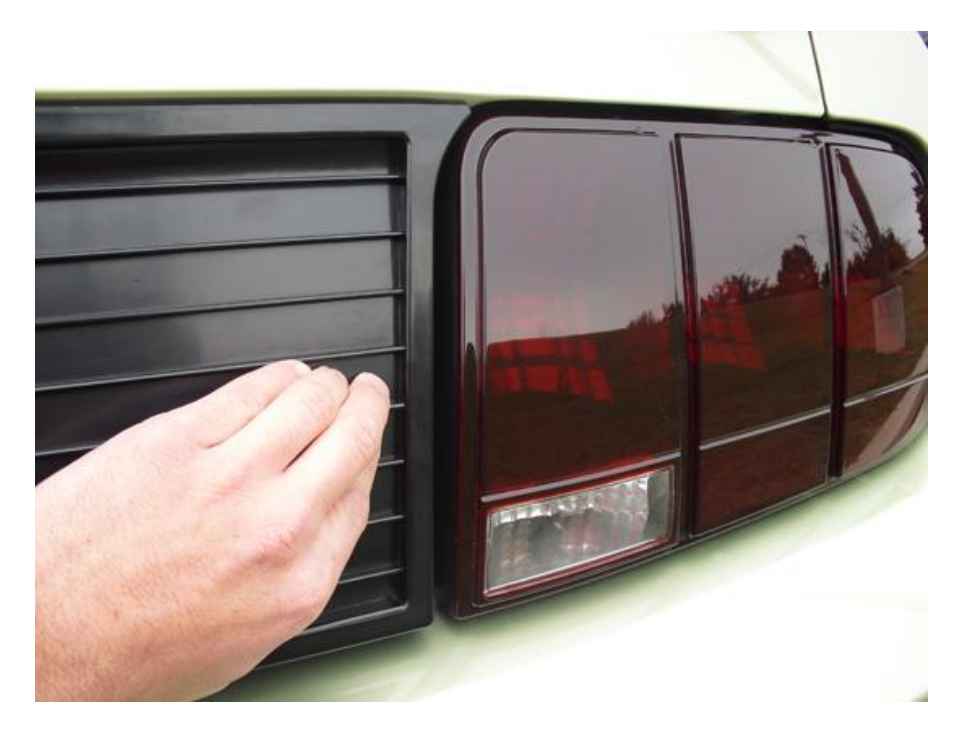
Installation instructions provided by Manufacturer

4. When blackout panel is properly aligned, firmly press down on adhesive strips to fully seat blackout panel.