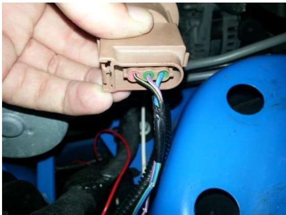
(2010-2014 Shown above)