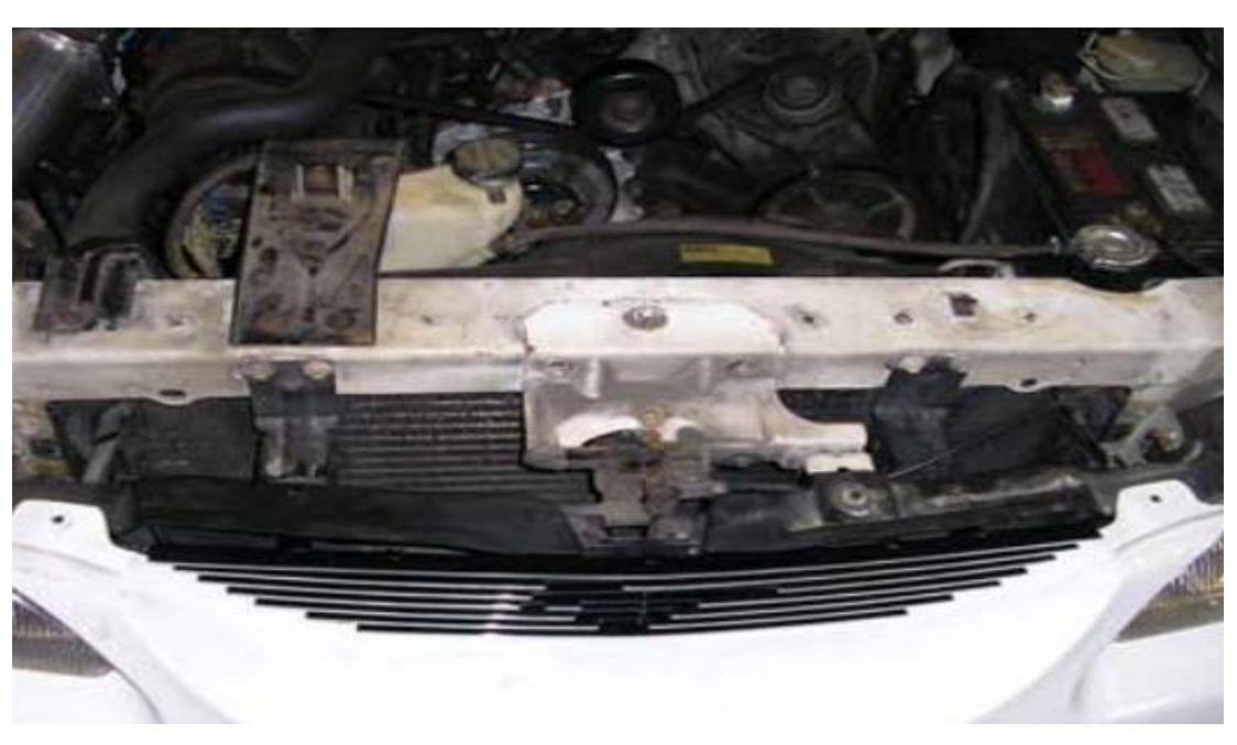
You're finished. Enjoy your new billet grille from Stack Racing.