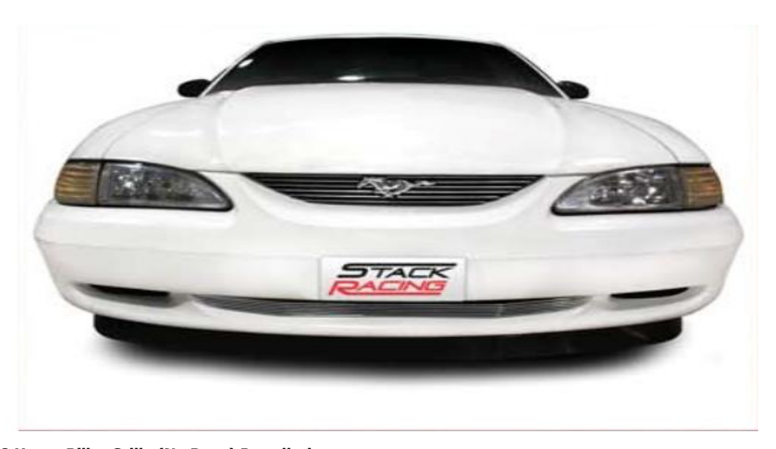
94-98 Upper Billet Grille (No Pony) Installation