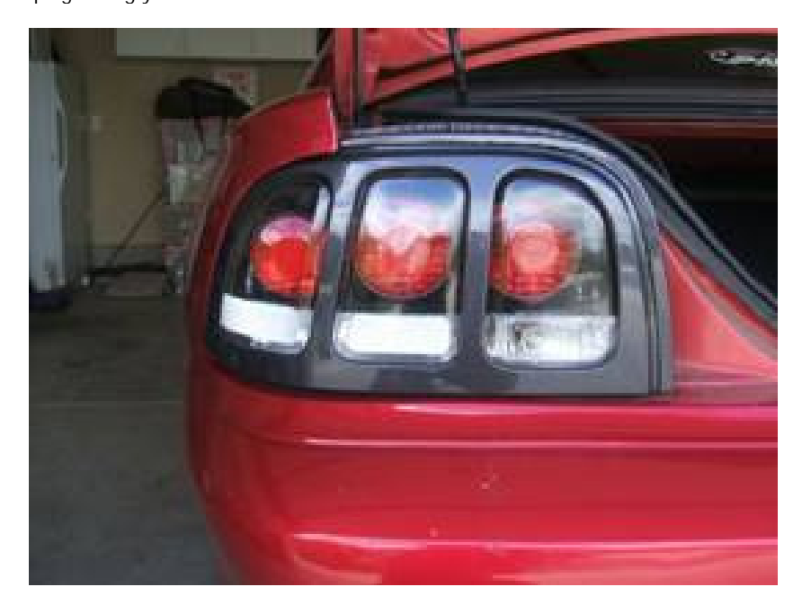
Installation instructions provided by AmericanMuscle customer Justin Pierce

8. Start your mustang up and check to make sure the blinker, brake light, and reverse lights are all working correctly. If so you are now finished the installation of your new carbon fiber taillights. Close the carpet trunk lining back up and re-apply the socket plugs using your screwdriver.