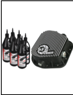
Rear Differential Cover