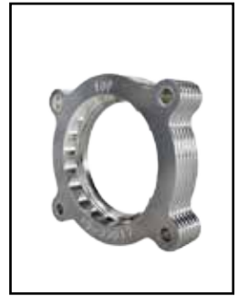
Throttle Body Spacer