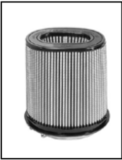
Pro DRY S Air Filter