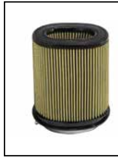
PRO GUARD 7