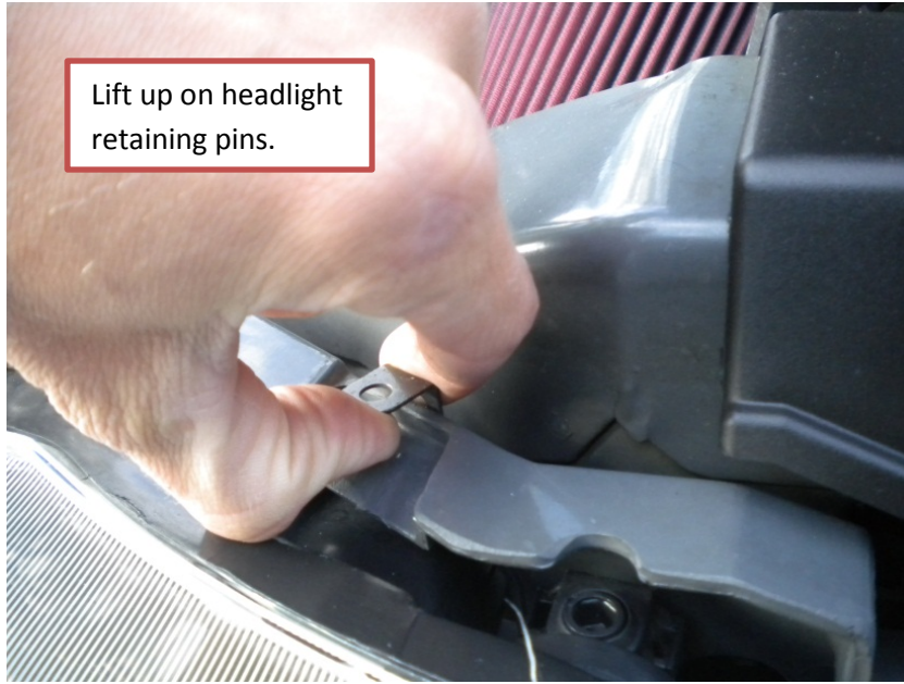
Lift up on headlight retaining pins.