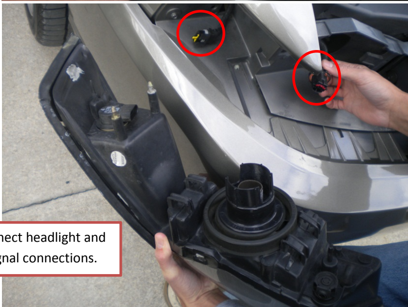
Disconnect headlight and turn signal connections.