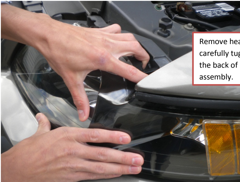
Remove headlights by carefully tugging on the back of headlight assembly.