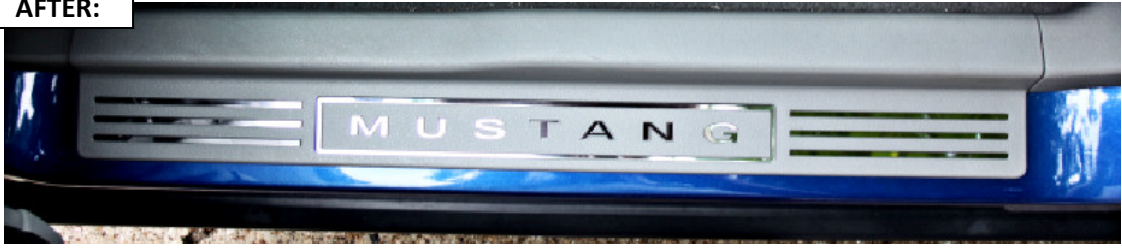
Installation Instructions written by AmericanMuscle customer Benny Lasiter 5.18.12