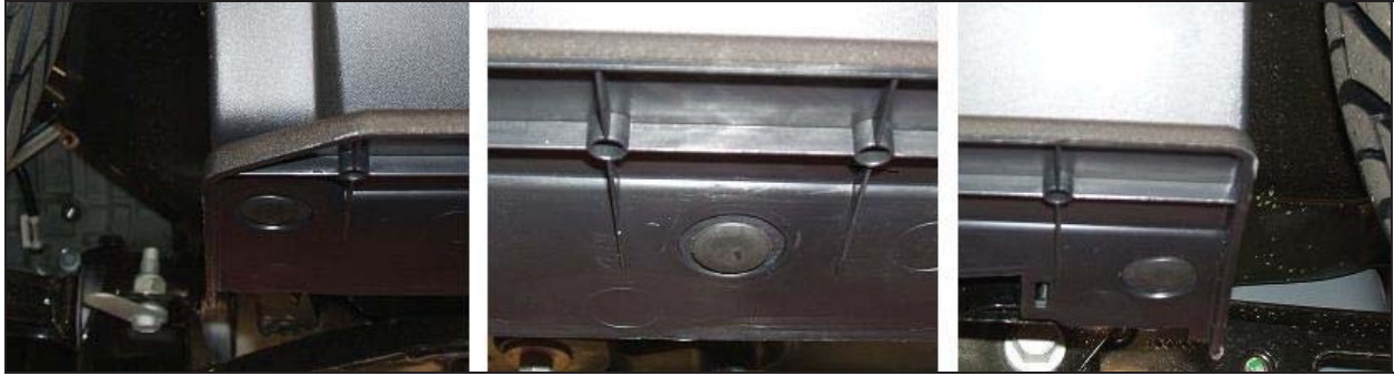
(Three of five Push Pins shown.) Figures 9

11. Install a new Push Pin into each of the five (5) drilled holes. Refer to Figures 9.