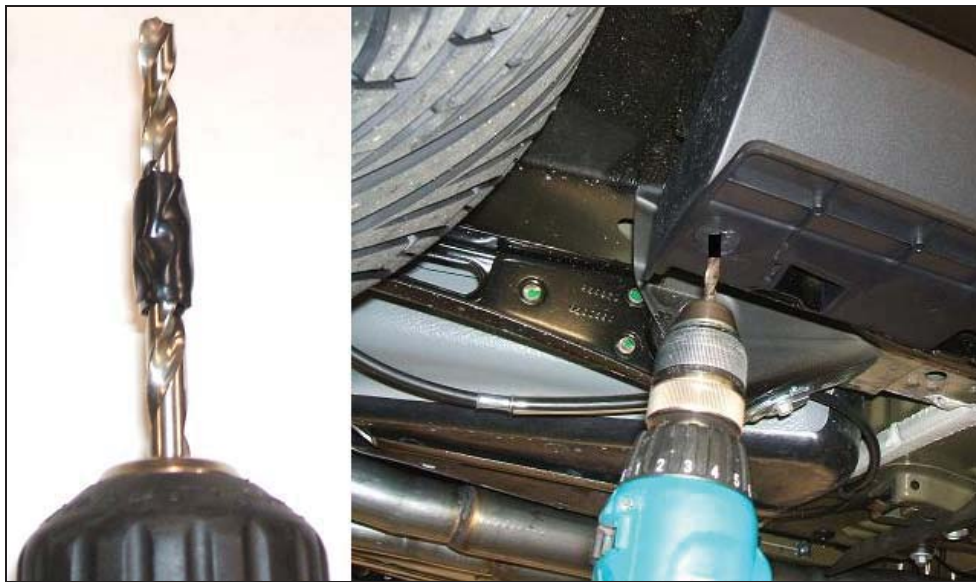
(Rear hole shown, others are similar)