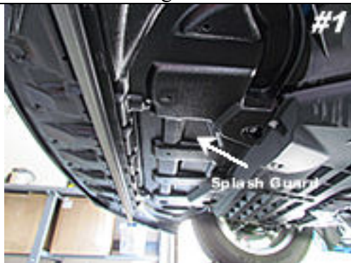
Black splash guard should be removed. It is held by 17 screws.