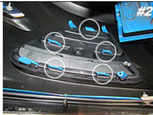
Depress each tab as you pull the bezel off. The bezels are tight. L.H. shown.