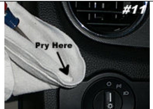
Pry up gently to loosen switch panel.