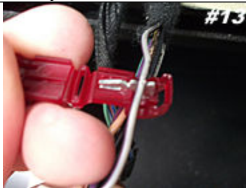
Slide wire into place and close wire tap firmly.