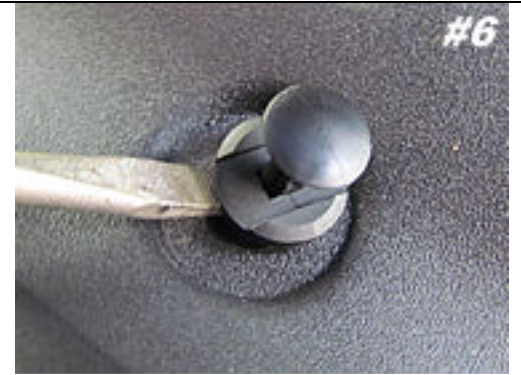
Pry up on center part of pin first. Then pry out entire retainer pin.