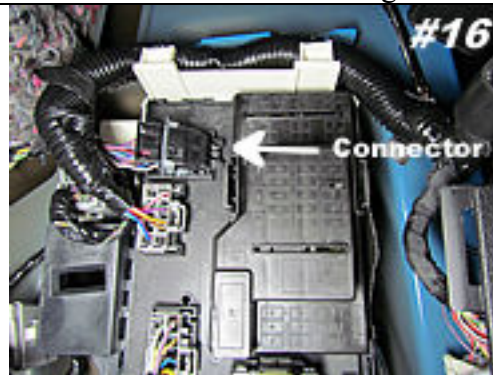
Connect to white wire on connector shown above using a wire tap.