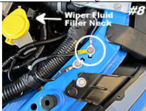
Attach ring terminal to bolt circled above. Firmly re-tighten the bolt.