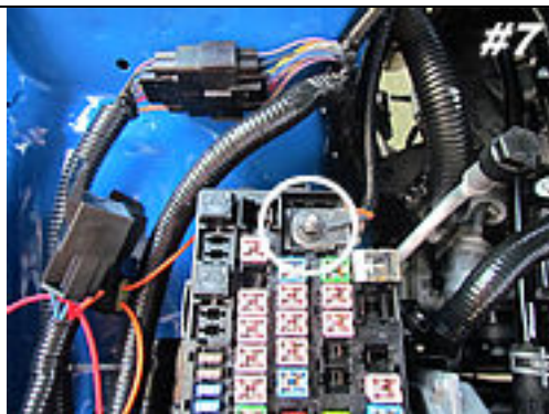
Be sure that the bolt is re-attached tightly enough that it will not loosen.