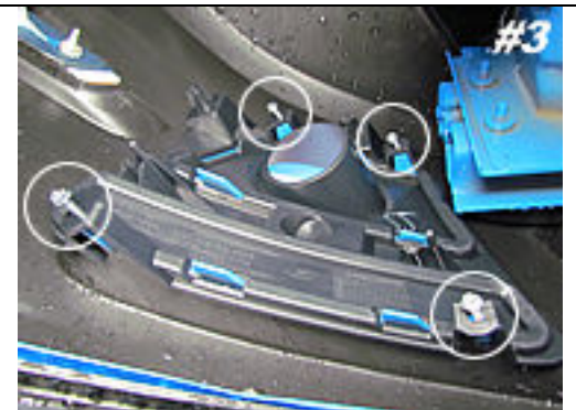
New bezel locks into place with 5 tabs and is secured by 4 screws.