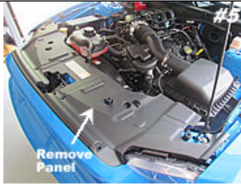
Remove black panel shown. Save 8 retaining pins for re-install later.