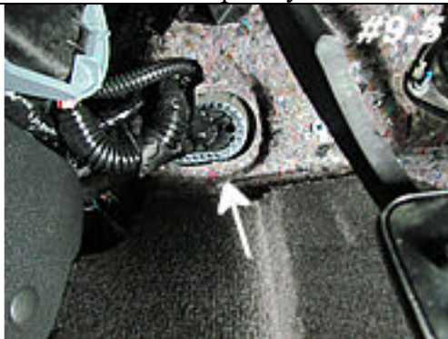
Cut small "X" in boot and route wiring through the hole.