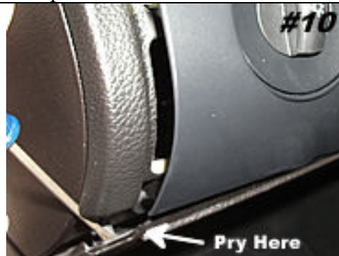
Pry downward slightly. Be gentle and cautious when doing so.