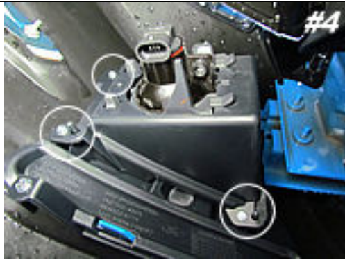
Drivers side fog light shown - looking upward from ground.