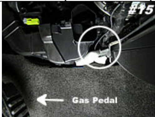
Pass black wire through the center console to passenger side kick panel.