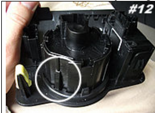
3 tabs hold switch in. One of the tabs is circled in the picture above.