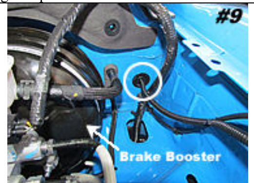
Cut small "X" in grommet and route wiring through the hole.