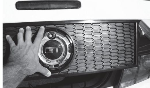
Fig. 2 – Place panel on car, using light hand pressure to check for proper fit BEFORE removing tape seal