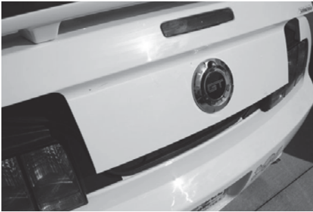
Fig. 1 – Hold Trunk Partially Open to aid installation