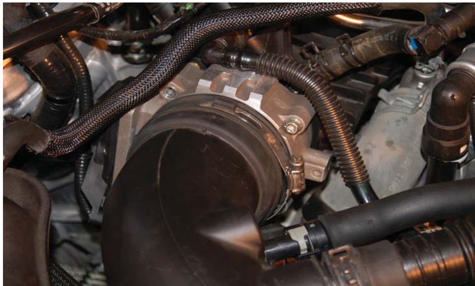
Fig. 6 BBK Throttle Body shown installed. Stock air inlet tube will fit the 85mm opening.