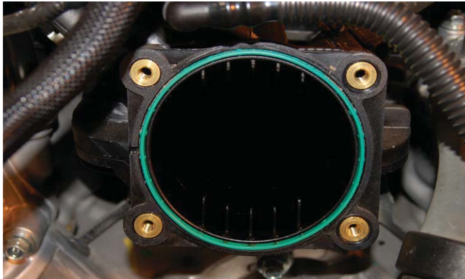
Fig. 5 Reuse the stock O-ring style gasket. Just wipe off oil and debris with a rag.