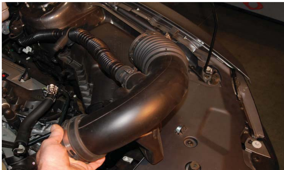
Fig. 3 Set air inlet tube aside, out of the way.