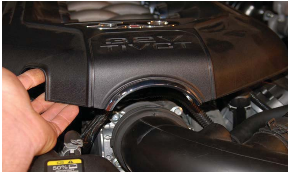
Fig. 1 Removing engine cover to access throttle body.