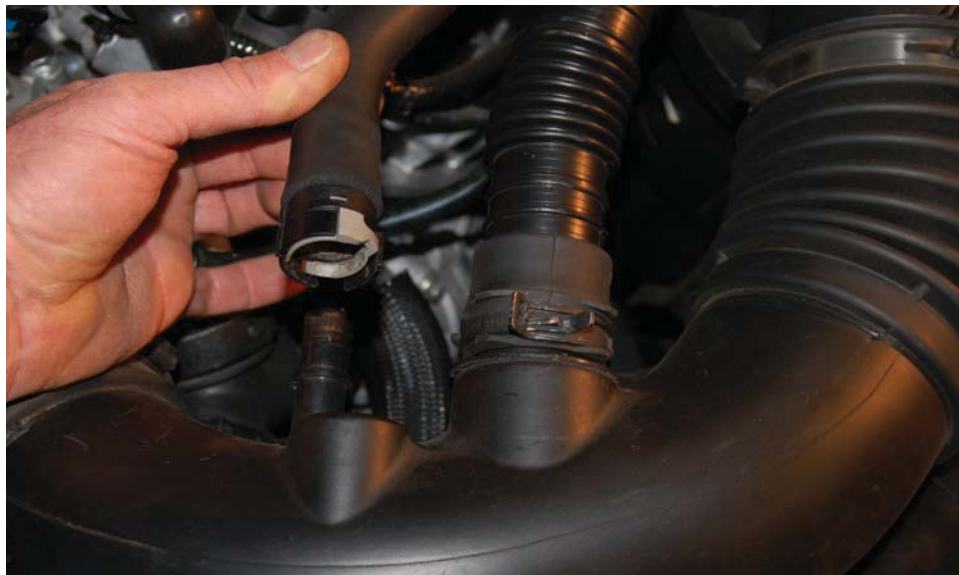
Fig. 2 Remove smaller breather tube. Larger sound tube can stay connected.