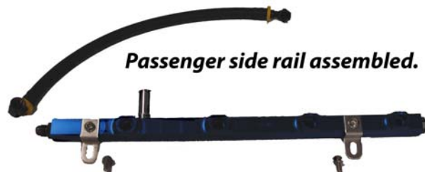
Passenger side rail assembled.

To view a video install of this BBK product visit www.bbperformance.com and search for part # 5015