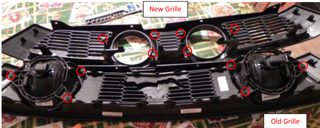
Installed Fog Lights in Eleanor Grille: