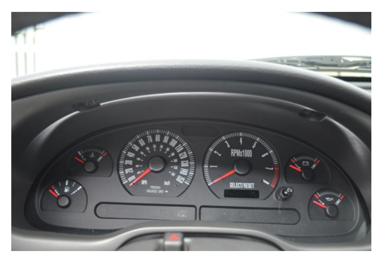
Installation Instructions written by AmericanMuscle Patrick Morrison 6.6.2012

14. Now you are finished, and if like me can finally see your gauges again! Go out and ride!