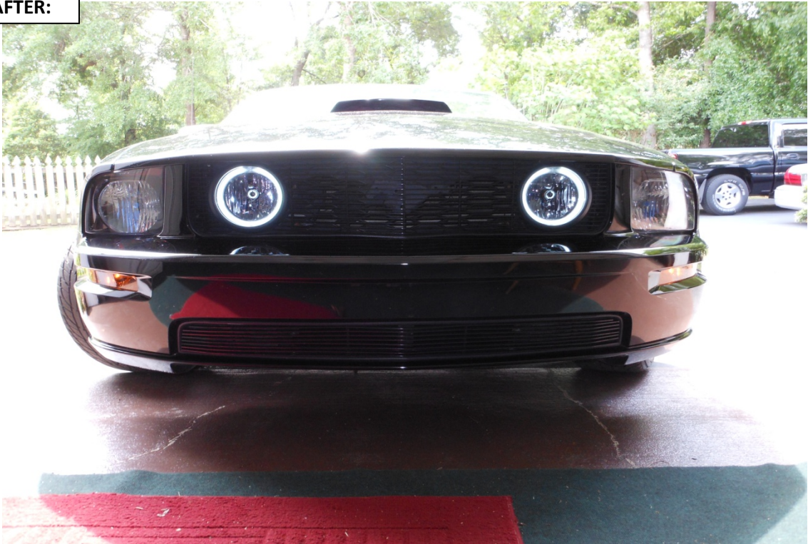
Installation instructions provided by AmericanMuscle customer Cody Lawson 4.30.12