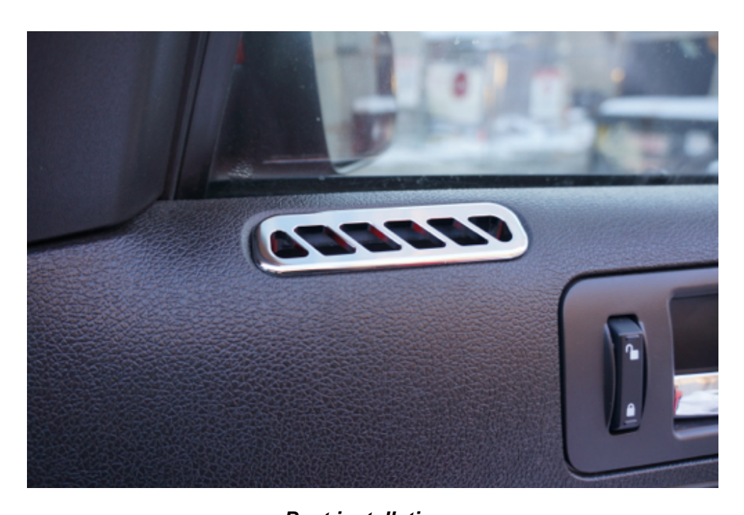
Post installation Installation Instructions written by AmericanMuscle customer A. Lara 4.2.13

4. Push down firmly until the chrome louver clicks and locks into place. Repeat the process on the other door panel.