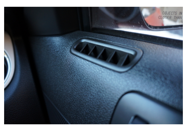
Pre-installation area with factory louvers