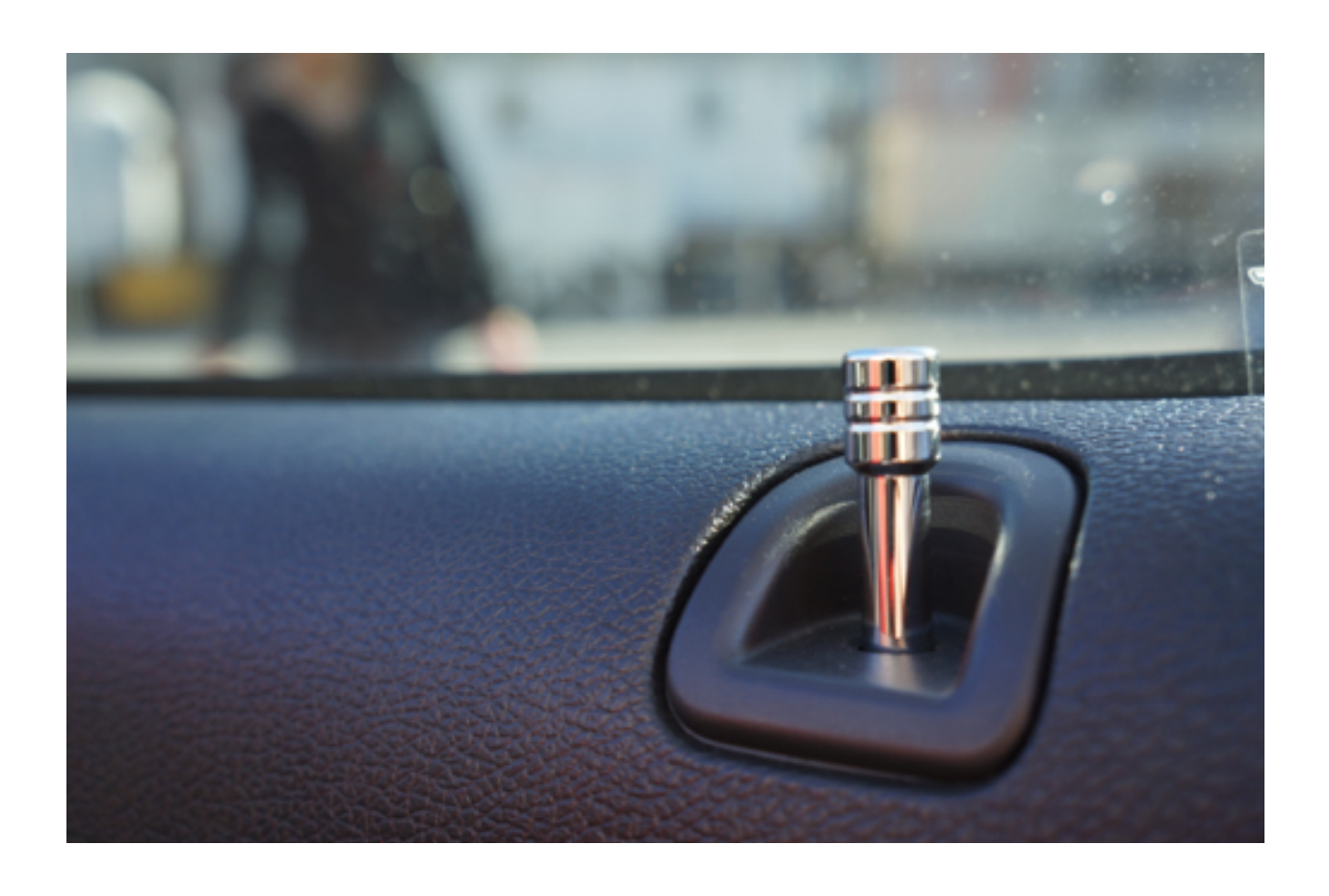
Post installation Installation Instructions written by AmericanMuscle customer A. Lara 10.22.12