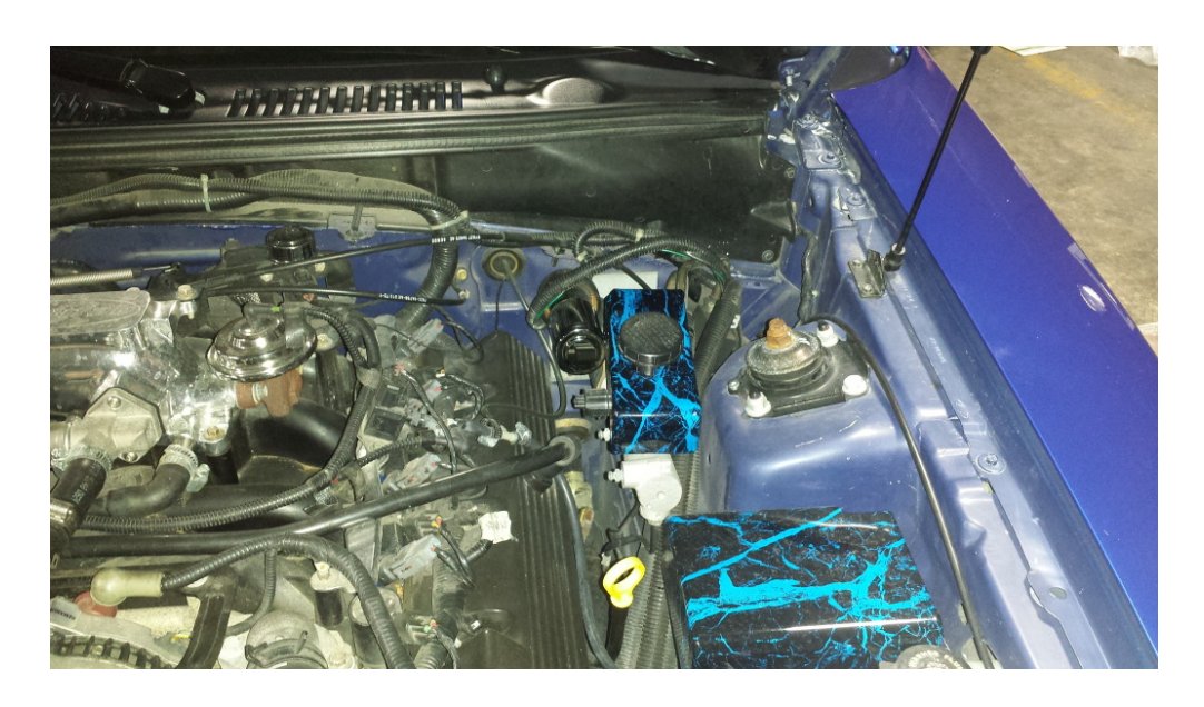
Installation Instructions Written By AmericanMuscle Customer Cortney Rahn 10/30/2013