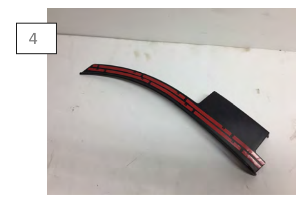
Apply the supplied 3M tape to the winglet surface as shown above.