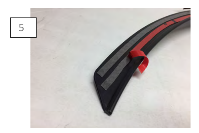
Peel off the tape backing prior to installing the winglet.