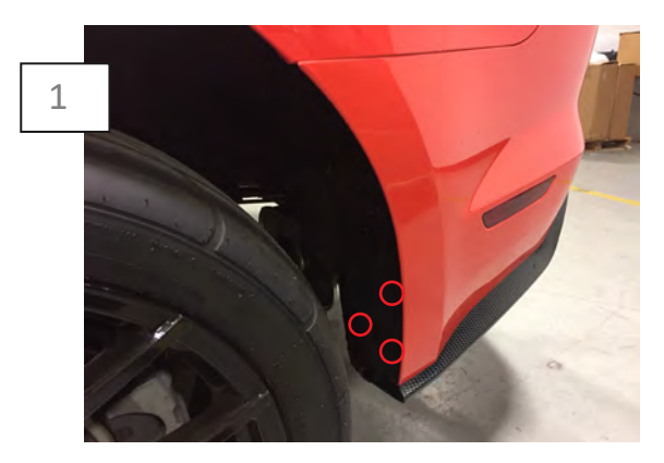
Remove the (3) fender liner clips and fold the fender liner out of the way.