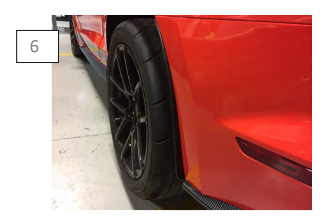
Using the factory hardware, bolt the winglet to the vehicle. Apply firm even pressure to the taped surface to ensure proper adhesion.