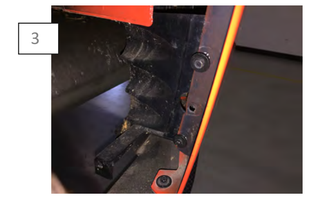
Using a 7mm socket, remove the (2) bolts securing the bumper cover to the bumper bracket. **Note: This hardware will be used when installing the winglet.