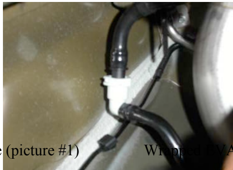
Wrapped EVAC Tube (picture #1)