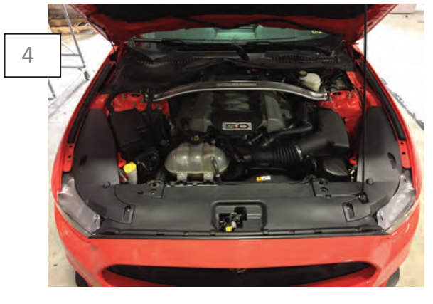
Remove the 3M Dual Lock Tape backing, posistion the cover, and install the push pins. Apply firm even pressure to the taped locations to ensure proper adhesion. **Note: The larger push clip is used on the rear hole. The smaller push clip is used on front hole.