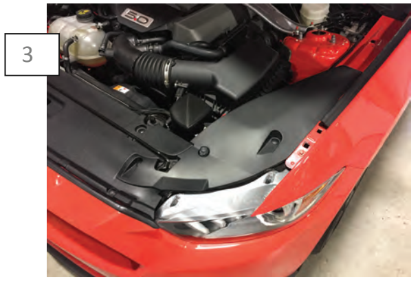
Test fit the part before removing the tape backing from the 3M Dual Lock. Do not install the clips at this time.