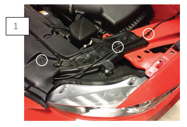
Begin by using a flat head screwdriver to carefully remove the outer radiator shroud push clip. Then carefully remove the (2) cable retaining clips on the hood latch cable. These will be left loose.