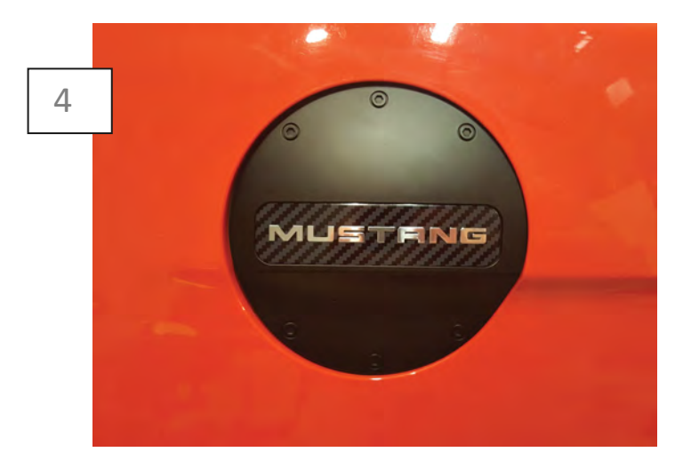
Slowly close fuel to ensure proper quarter panel clearance.