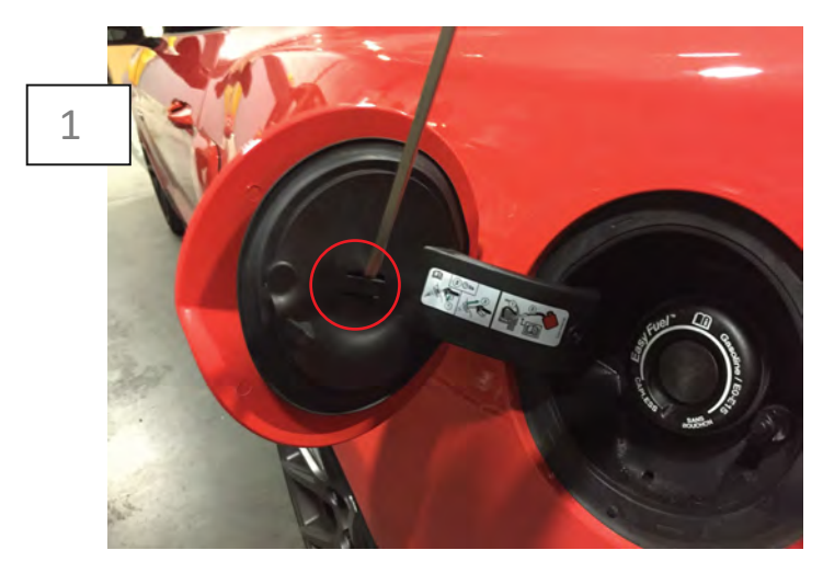
Open the factory fuel door. Using a small flat head screw driver, apply light pressure on the center clip.