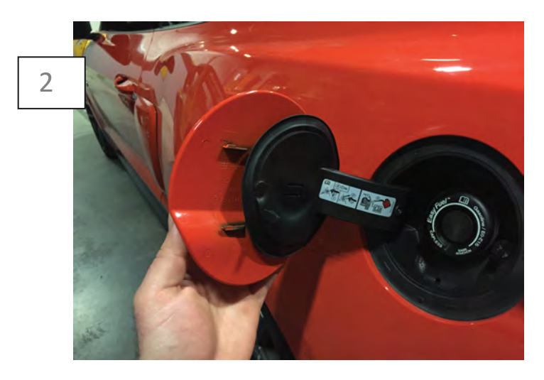
Slide the factory fuel door off the fuel door hinge.