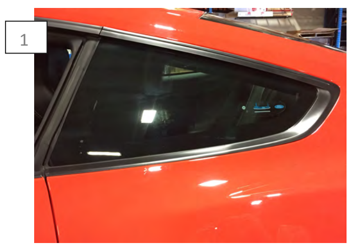
Wash the quarter window with soap and water. Allow the window and surrounding area to dry. **Recommended: Wipe the window down with isopropyl alcohol to ensure the cleanest surface possible.