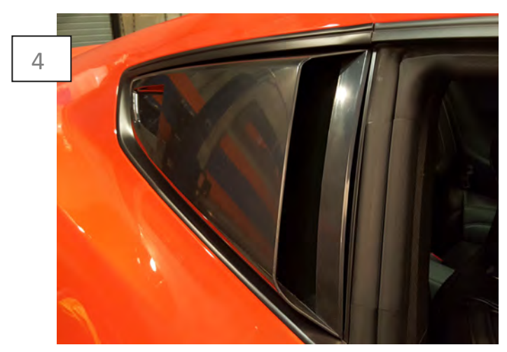
Apply firm even pressure to all taped surfaces to ensure proper adhesion.