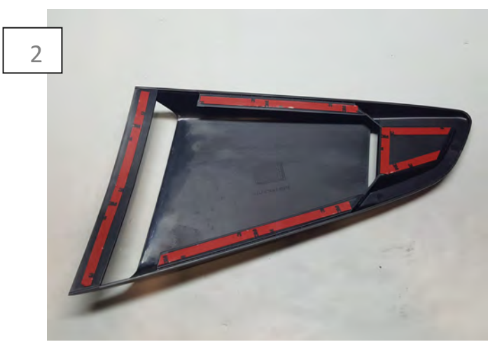
Apply the supplied 3M tape to the scoop as seen above. Test fit the insert on the scoop to familiarize yourself with how it fits.