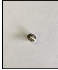
M4-.7 x 4mm Set Screw (2)