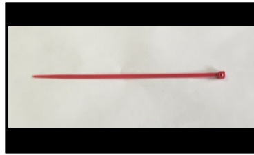
6" Tie Wrap