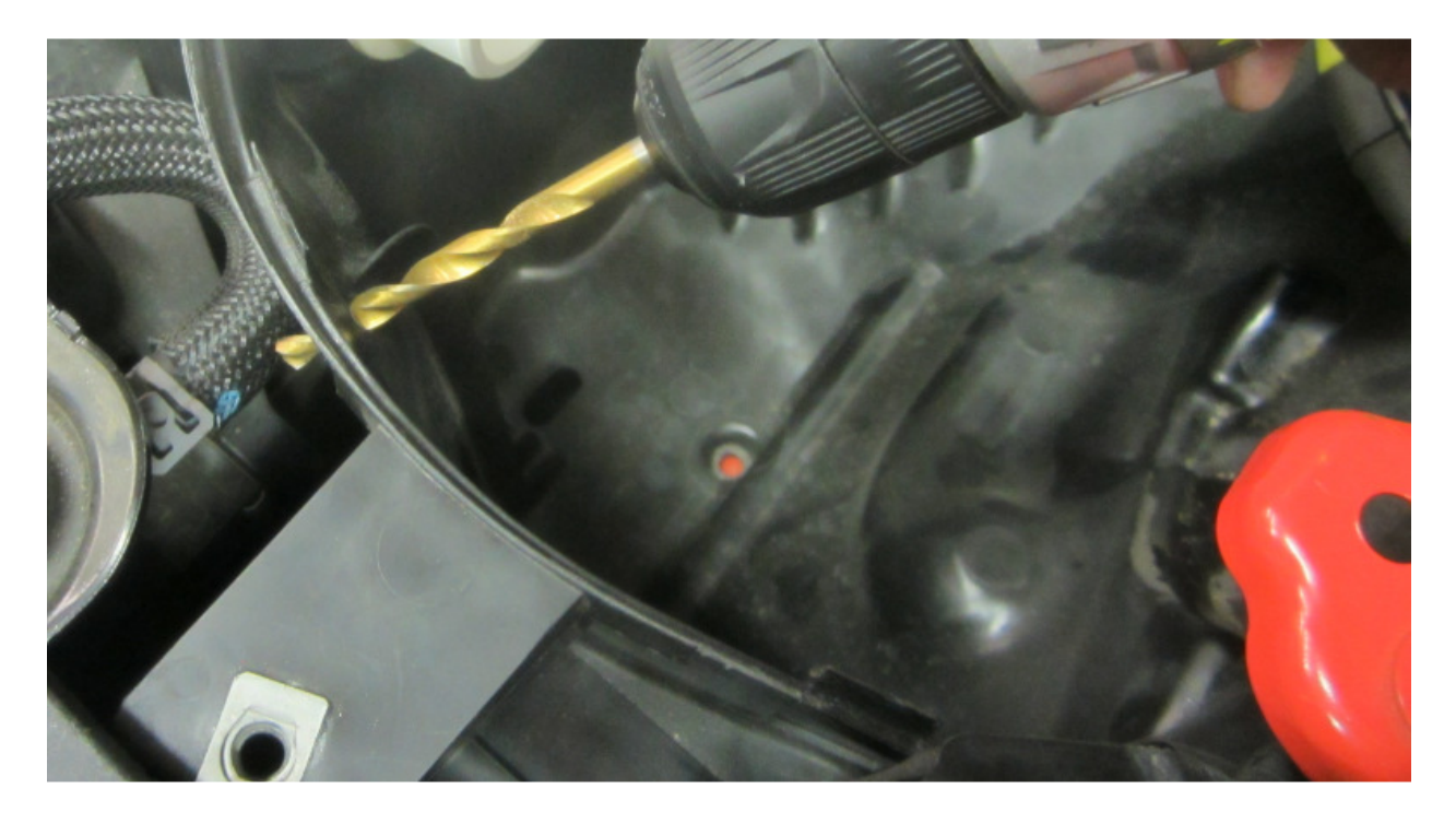
Drill hole for harness retainer.

NO PART OF THIS DOCUMENT MAY BE REPRODUCED WITHOUT PRIOR AGREEMENT AND WRITTEN PERMISSION OF FORD PERFORMANCE PARTS