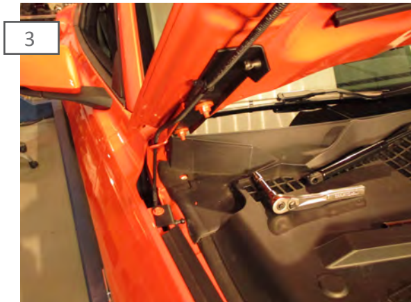
Slide the bracket between the loosened hood nut, and the hood hinge. Then reinstall remaining hood nut. **Note: Passenger side bracket will require you to remove the windshield washer hose retaining clip.