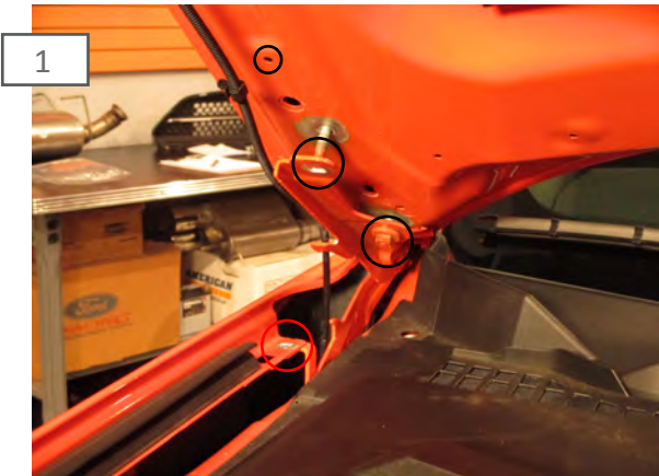
Remove the rear most 10mm fender bolt. Remove the forward most 13mm hood nut. Loosen the rear most hood bracket nut so that you can slide the upper mount bracket on.