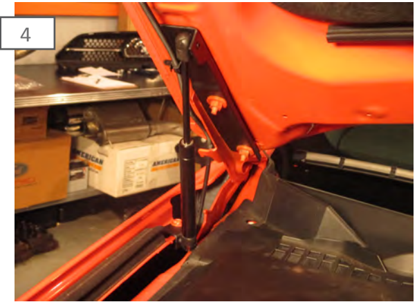
Install supplied gas strut onto mounting brackets. **Note: slowly close hood to make sure the hood clears the fender. Re-alignment of the hood may be required if the hinge shifted during install.