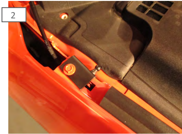
Re-install fender bolt through the lower strut mount bracket.