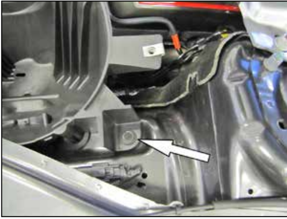
7. Remove the bolt shown that secures the lower heat shield to the inner fender.