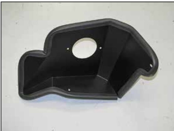
11. Install the provided edge trim onto the heat shield as shown. NOTE: Some trimming of the edge trim will be necessary.