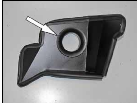
12. Install the filter adapter into the heat shield and secure with the provided hardware.