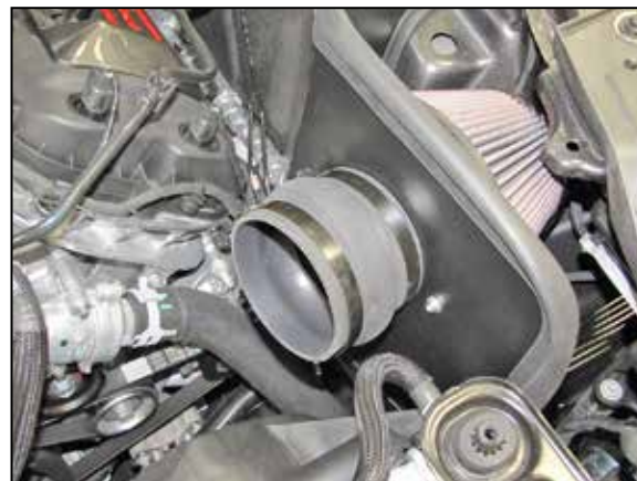
16. Install the provided hump coupler (08418) onto the filter adapter and secure with the provided hose clamp.