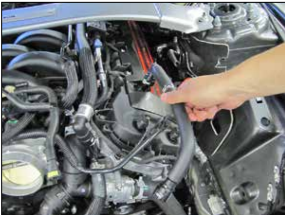
9. Remove the crank case vent hose from the valve cover.