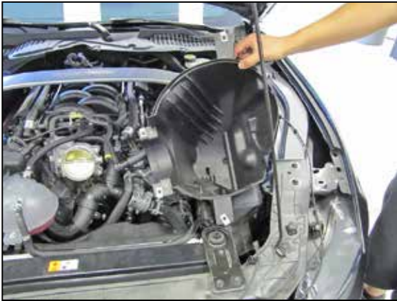
8. Remove the lower heat shield from the vehicle. NOTE: K&N Engineering, Inc., recommends that customers do not discard factory air intake.