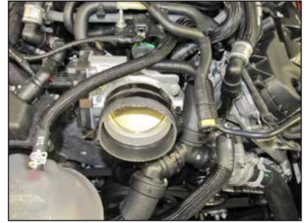
17. Install the provided coupler (08618) onto the throttle body and secure with the provided hose clamp.