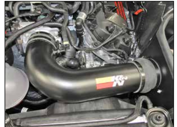
21. Install the K&N® intake tube into the coupler at the filter adapter and then into the coupler at the throttle body, adjust the tube for best fit and then secure with the provided hose clamps.

NOTE: Plastic NPT fittings are easy to cross thread. Install the vent fitting "hand" tight, then turn it two complete turns with a wrench.