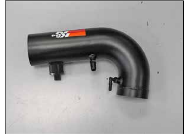
20. Install the two vent fittings into the K&N® intake tube as shown.

NOTE: Plastic NPT fittings are easy to cross thread. Install the vent fitting "hand" tight, then turn it two complete turns with a wrench.