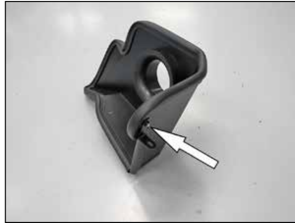
13. Install the provided heat shield bracket (064326) onto the heat shield and secure with the provided hardware.