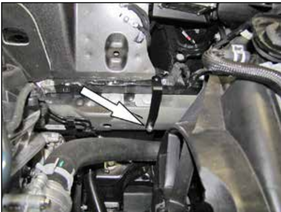
10. Install the heat shield mounting bracket (064325)