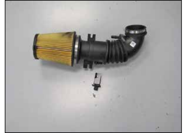
18. Remove the mass air sensor from the factory intake tube.