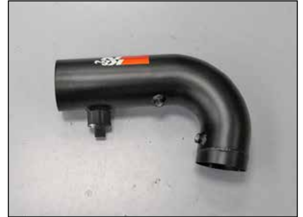
19. Install the mass air sensor into the K&N® intake tube and secure with the provided hardware.