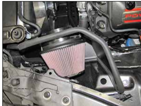
15. Lean the heat shield in enough to install the K&N® air filter onto the adapter and secure the filter with the provided hose clamp. Then secure the heat shield mounting bracket to the inner fender with the provided hardware.