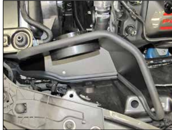
14. Install the heat shield onto the lower mounting bracket and secure it to the mounting bracket only with the provided hardware.