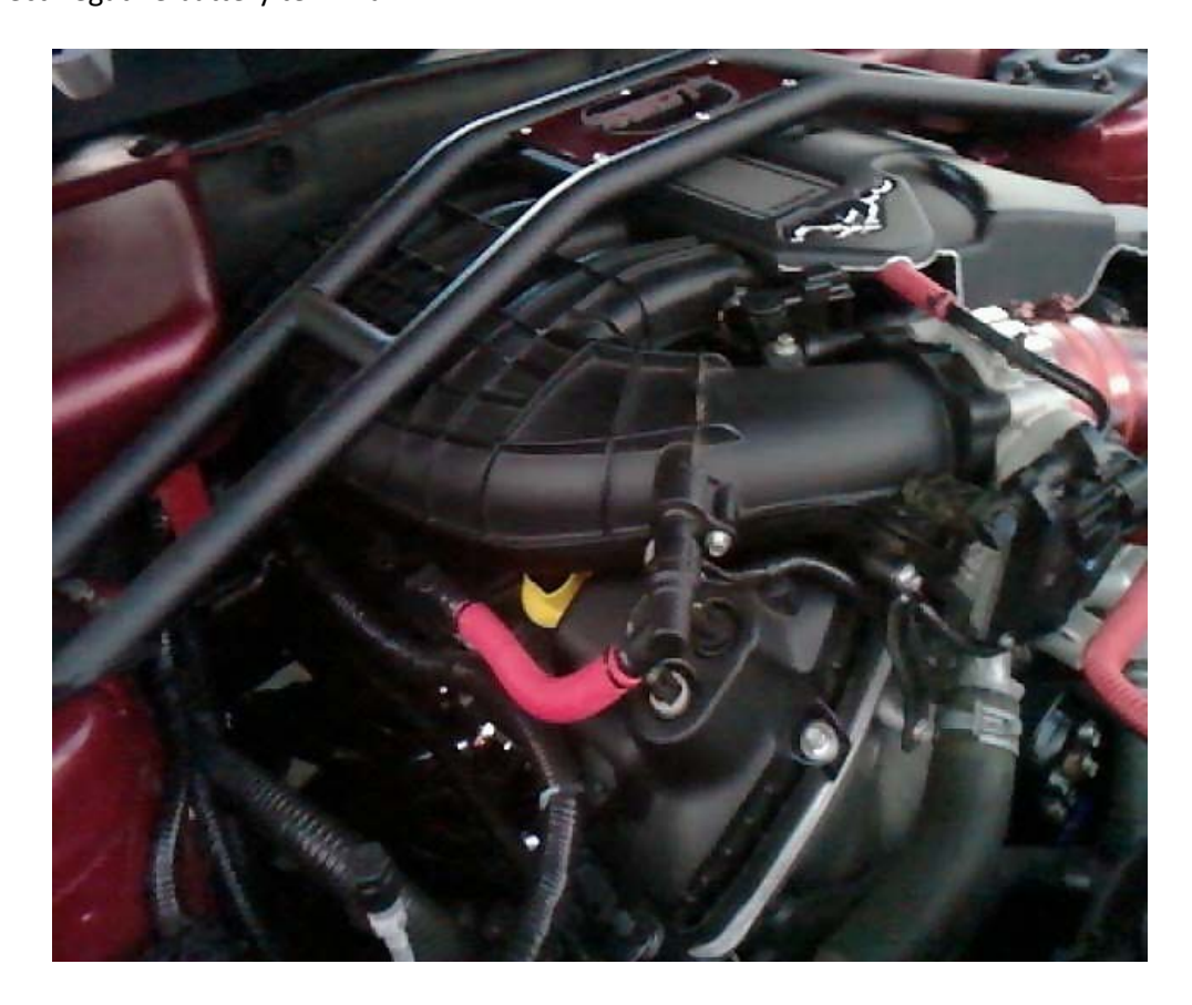
Installation Instructions written by AmericanMuscle customer Robbie Walker 4.4.2012