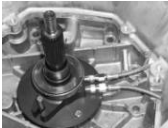
Bearing/collar in place

Remove the factory bearing from the front of the transmission. Install the RAM collar and spacer using the supplied M6 bolts. Install the drive stud in the RAM collar. Slide the bearing over the collar.