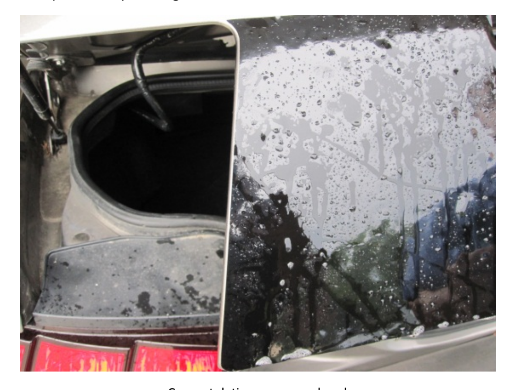
Congratulations, you are done!

6. On the last two sections, make sure you have them overlapping the other piece on the opposite side of the taillight, but don't fold it over until dry. There should be a slight reveal along the edge of the deck lid. After it dries, fold the flap and do any finishing touches.