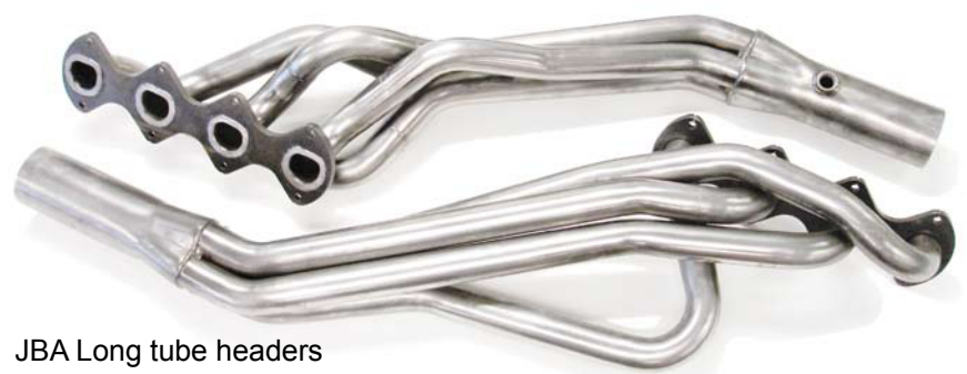
JBA Long tube headers p/n 6673S

To get more power out of your Mustang, JBA offers long tube headers-headers and high flow h-pipes for the 4.6L. For more information about these and other quality performance products from JBA visit us online at www.jbaheaders.com