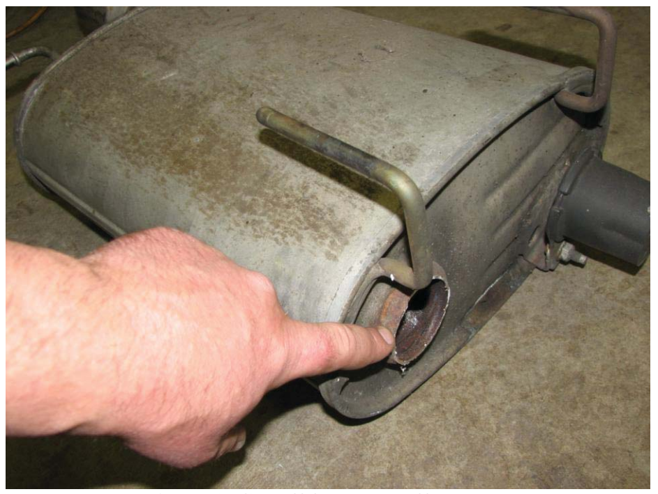
Figure 1: Cut off factory mufflers here

2. With a Sawzall or other equivalent tool suitable for cutting metal, cut the factory mufflers off (both driver and passenger side) where shown in figure 1. De-burr the ends of the pipes left on the car.