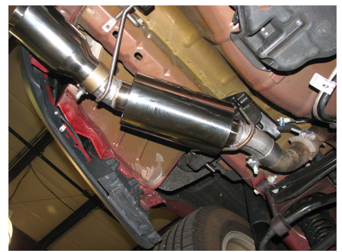
Figure 2: Finished Installation