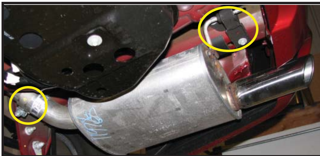
Photo : Passengers Side Factory Axle Back Muffler