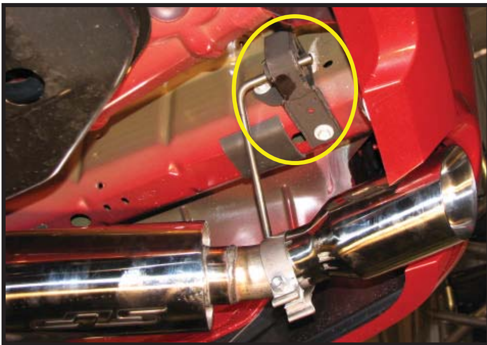
Photo : Passengers Side Rear Bracket