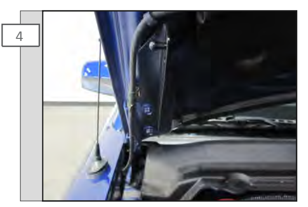
Loosen the rear most bolt on the hood hinge just enough to slide the larger bracket (marked P-U) in between the hood hinge and bolt. (do not install the bracket between the hood hinge and hood) Re-install/tighten bolts to secure bracket.