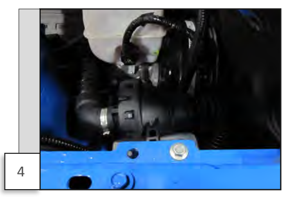
Re-insert the metal bushing (removed in Step 2) into the bottom right side of the bracket and re-install assembly on the bottom side of the inner fender using the original hardware (removed in Step 1).