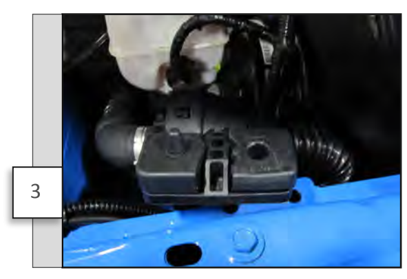
Remove the square rubber bushing from the bracket and cut ½" from the center of it. Place the two halves of the bushing onto the top side of the bracket as shown.