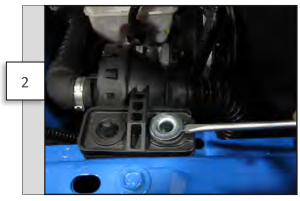
Using a flat head screwdriver or trim removal tool, pry the metal bushing from the bracket as shown.