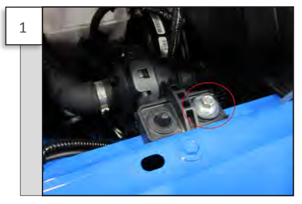
Remove the bolt holding the canister bracket to the inner fender. Also remove the factory u-nut from the fender for reuse.