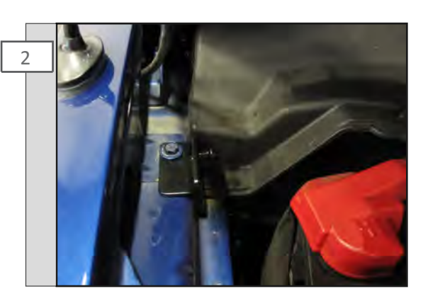
Install bracket marked P-L using factory fender bolt as shown.

Making sure the hood is properly supported by the factory prop rod, remove the forward most bolt on the hood hinge.