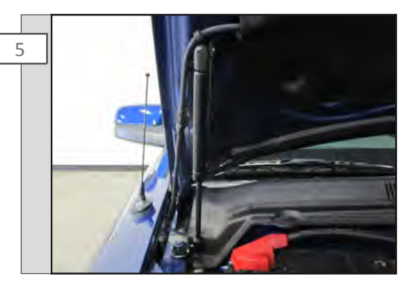
Pop the ends of the strut over the ball mounts on the brackets. Repeat steps 1-5 for drivers side. (do not slam hood shut yet) Check bumper/fender alignment by slowly lowering the hood. If okay, remove factory prop rod and enjoy.