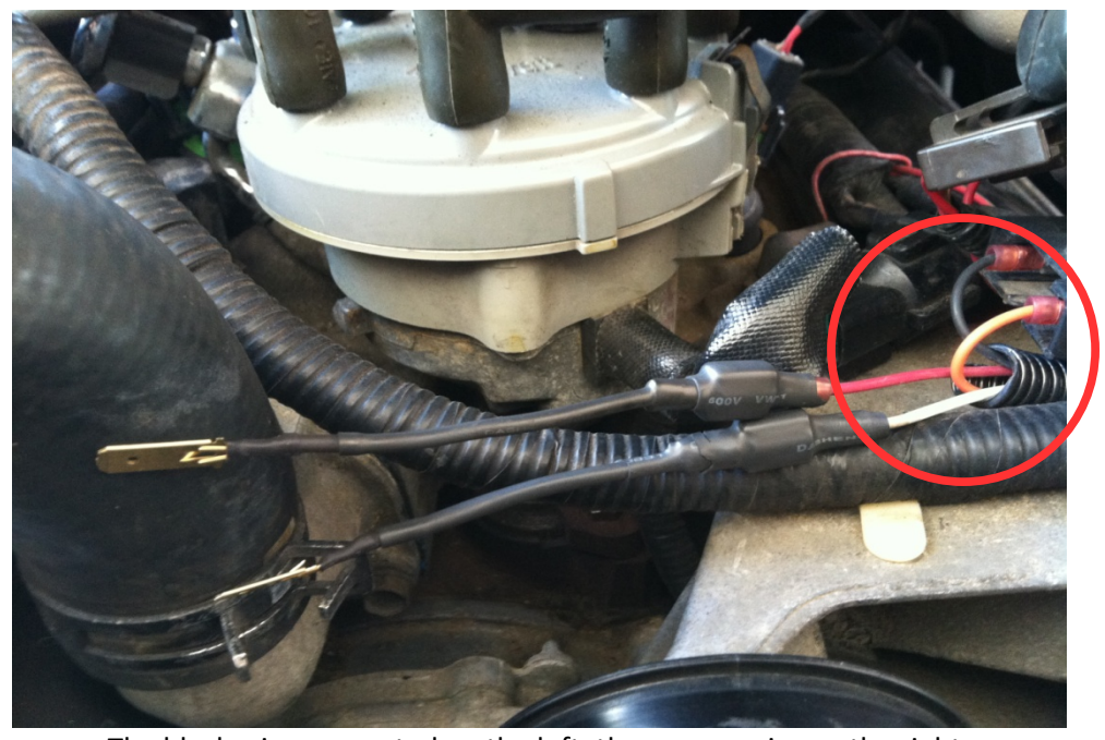
The black wire connected on the left; the orange wire on the right.