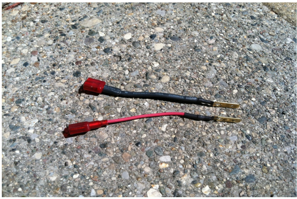
Here are the red and white wire extensions with the male connectors crimped on.

7. Attach wire extensions to the main wiring harnass, connecting red to red and white to white.