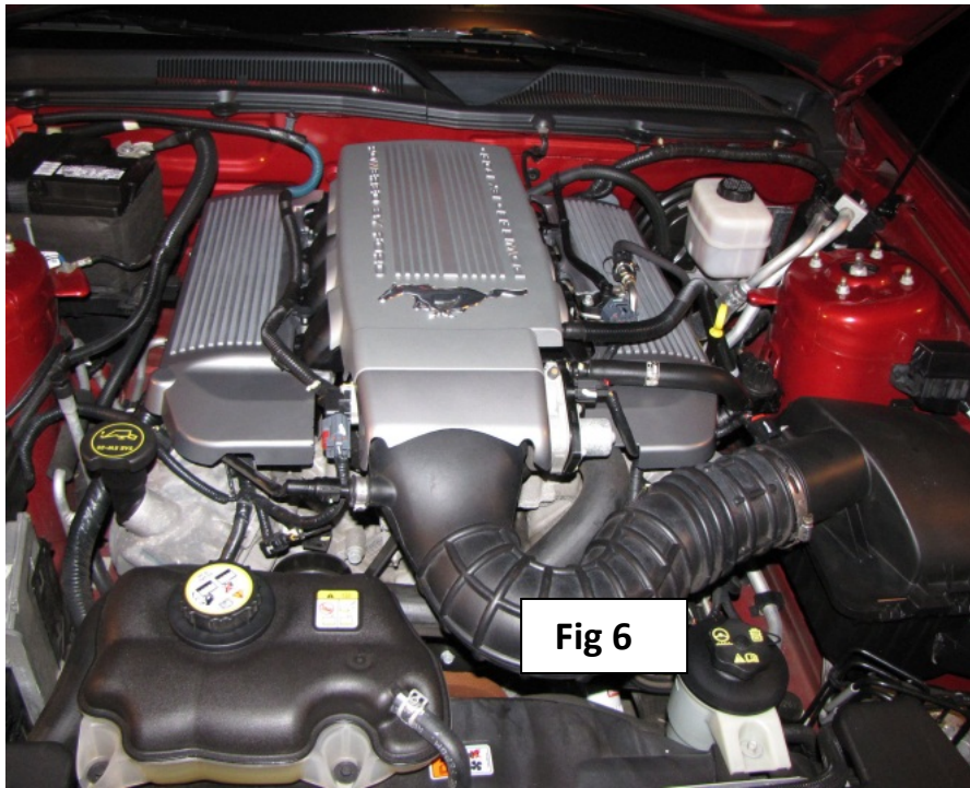
Installation Instructions Written By American Muscle Customer Ryan Eichner 2/13/2013