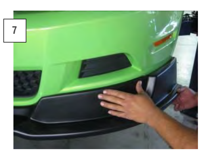
7. After the chin is in place as shown in the image below, completely remove the 3M backing and firmly press the chin to the fascia to activate the adhesive of the 3M tape.