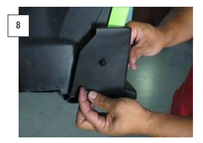
8. Reinstall the 7mm screws that were removed in step #3.