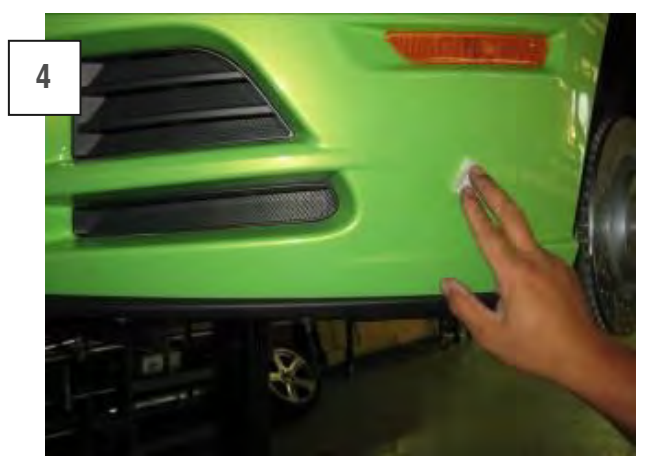
4. Clean the fascia / chin spoiler bonding surfaces with the supplied alcohol packs. Allow the alcohol to dry, then apply the 3M adhesion promoter. NOTE: Do not apply adhesion promoter above bonding area; it will leave a visible residue. Escess can be cleaned off iwth wax and grease remover if needed.