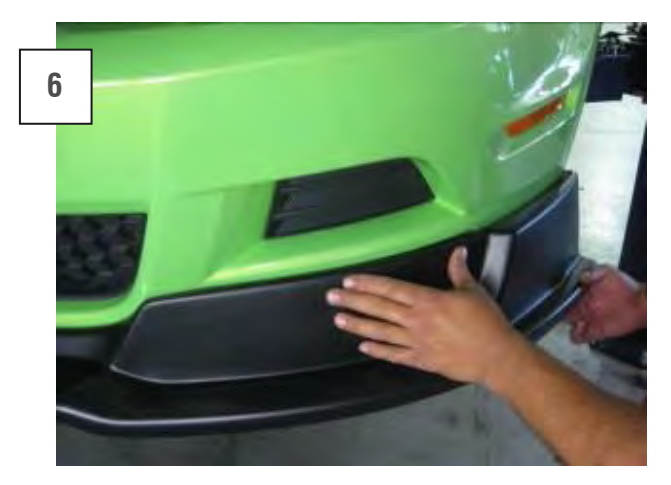
6. Peel the red backing off the 3M tape (pre installed on the chin spoiler) to create pull tab.