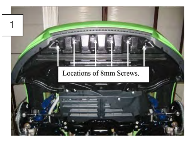
1. Remove the (6) 8mm screws that secure the center section of the factory splitter.

This install was performed on a hoist for ease of taking photographs, however it is not requirred. Elevating the car and placing the car on jack stands will make the installation easier, but it is optional. Follow all safety procedures if you choose to place the vehicle on jack stands.