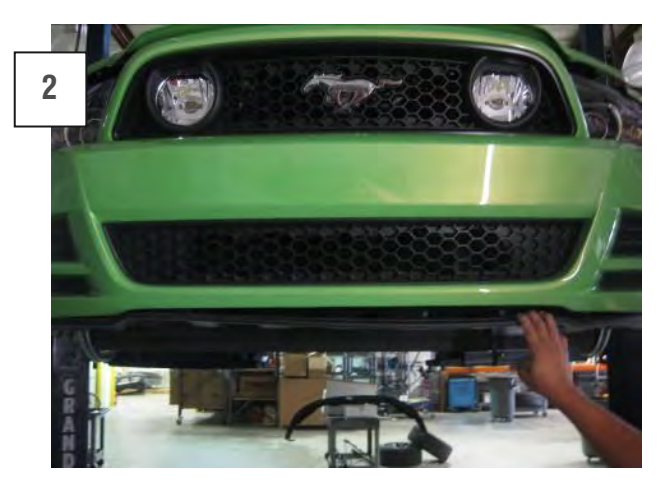
2. Pull down on the factory splitter to separate it from the fascia. NOTE: The splitter will not be removed. Your RTR chin spoiler will fit between the fascia and the splitter.