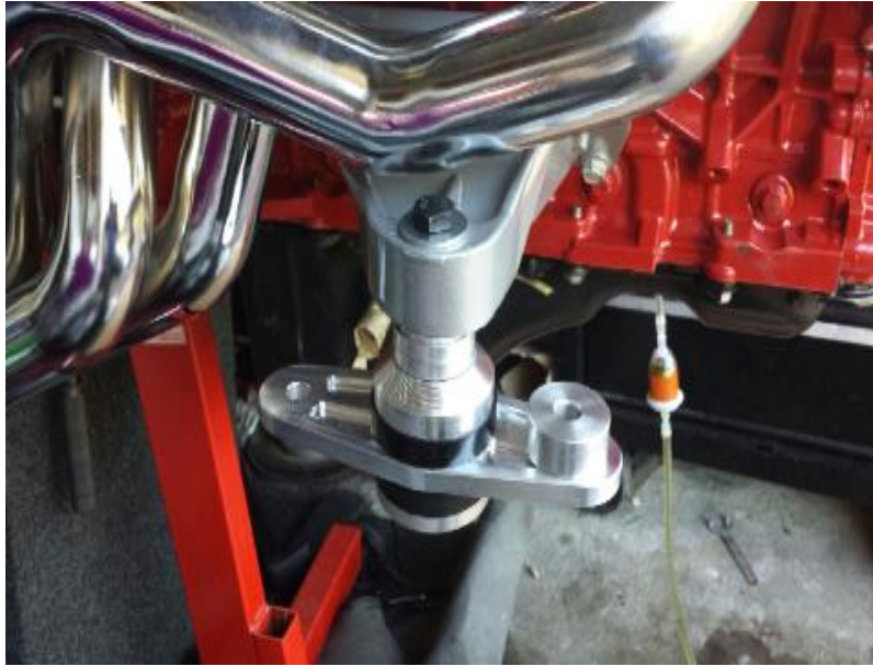
Lowered a \frac{1}{4} in (requires smaller bolt)