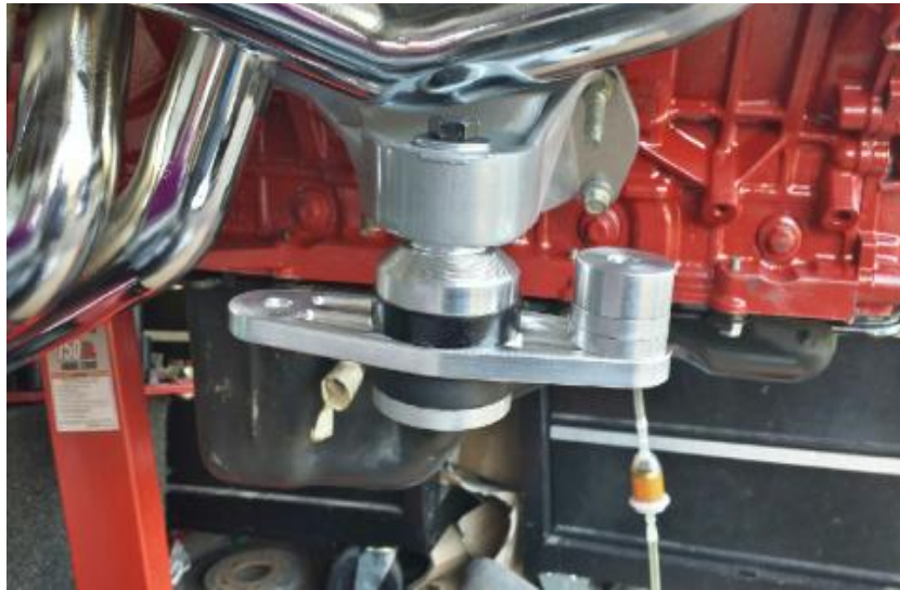
Lowered all the way about 1\frac{1}{4} in (requires the small bolt)