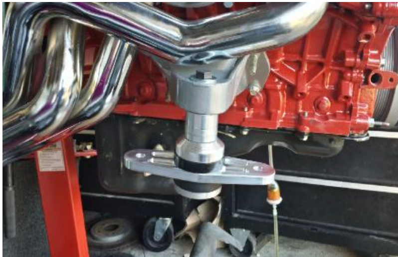
Stock Height (Requires the longer bolt)